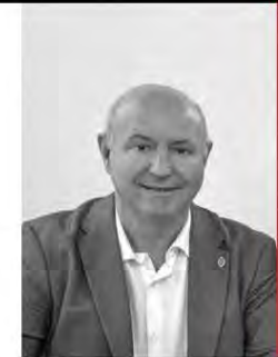
Miquel Nadal Vaquer, Mayor of Sóller.